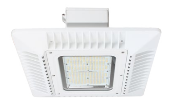
PAD Canopy Light