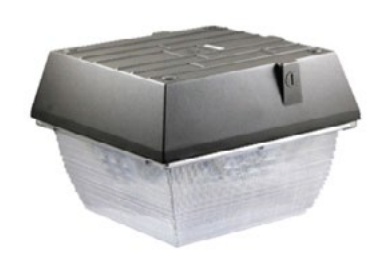
LED Parking Garage light