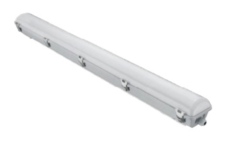
LED Vapor Tight