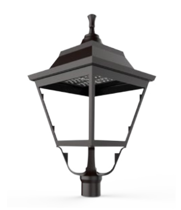
PAVILION LED POST TOP