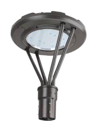
LED MOON SERIES POST TOP