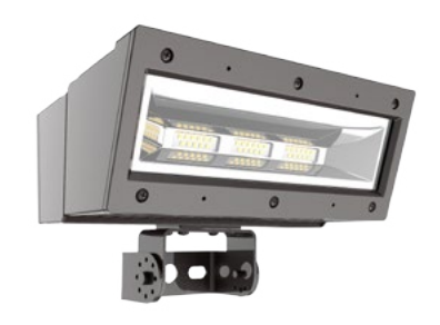
LED V-Line Flood Light