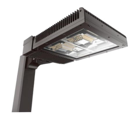
MT LED Area Light 100W 150W 200W