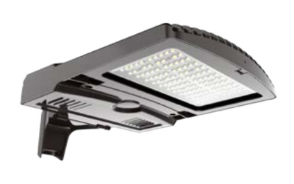
SMT LED Area Light