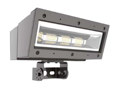
LED V-Line Flood Light