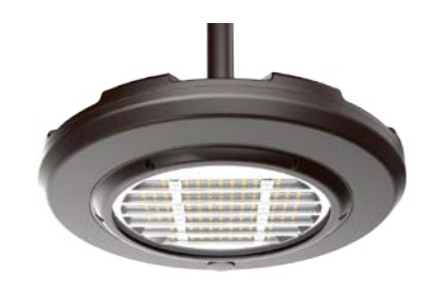
LED MOON SERIES LOW BAY