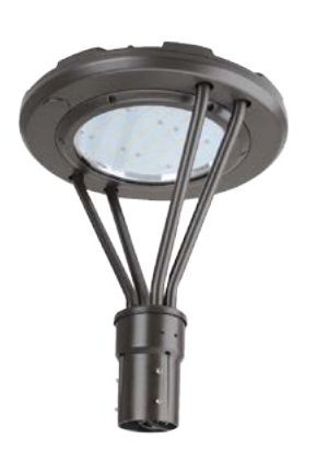
Led Moon Series Post Top