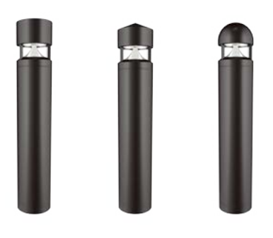
Standard LED Bollards