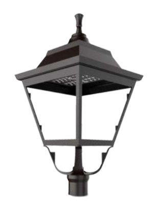
Pavilion Led Post Top