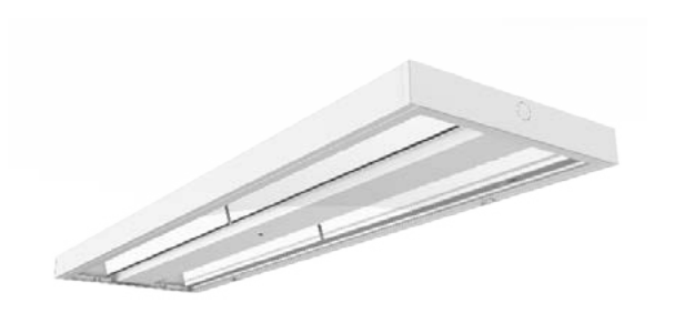
LED Linear High Bay