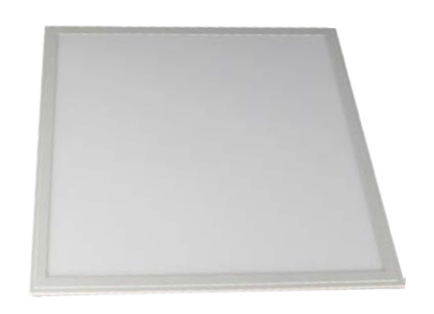
LED Flat Panel