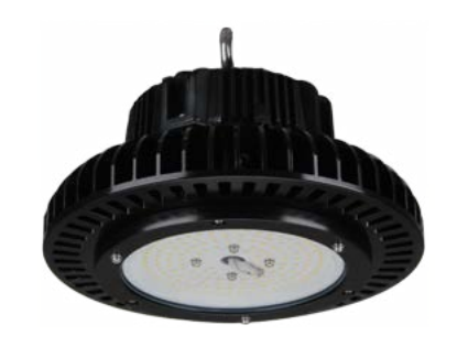
LED UFO High Bay Light