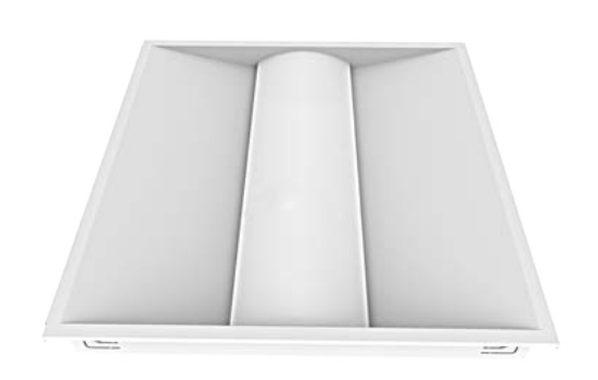
LED Center Basket Troffer