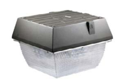
LED Parking Garage light