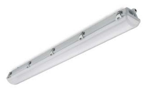
VISION LED Strip Light