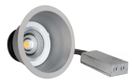
LED Commercial Downlight Retrofit Kit 6 inch& 8 inch