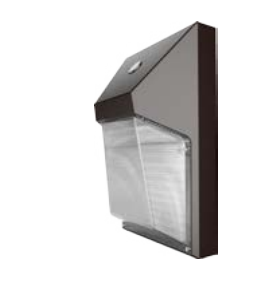
LED TR Security Light