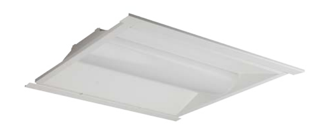
LED Troffer Retrofit Kit-DL 2x2