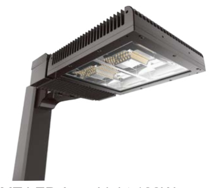
MT LED Area Light 100W 150W 200W