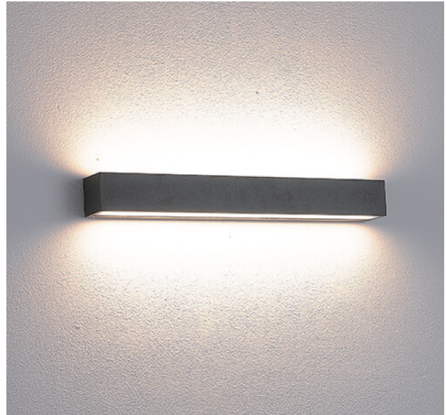
Direct and Indirect Light