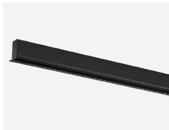
Magnetic Track Profile Recessed with Flange